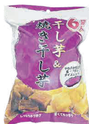
Mixed sweet potato

Internal capacity: 30g Inside specification: 30gX2X50