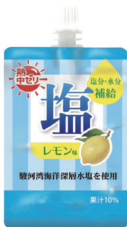
Sea salt lemon flavor