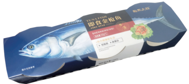
Water/oil/Miso Ready-to-eat tuna

Internal capacity: 85g Inside specification: 85gX60