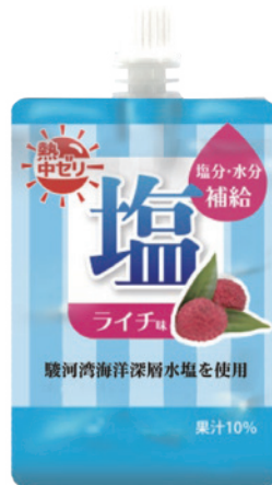
Sea salt lychee flavor