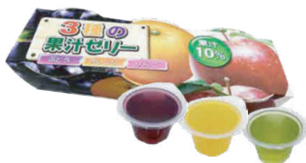
Triplet Fruit Juice Jelly (Grape + Sweet Orange + Apple)