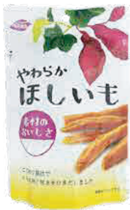
Sweet potato article

Internal capacity: 70g Inside specification: 70gX12X4