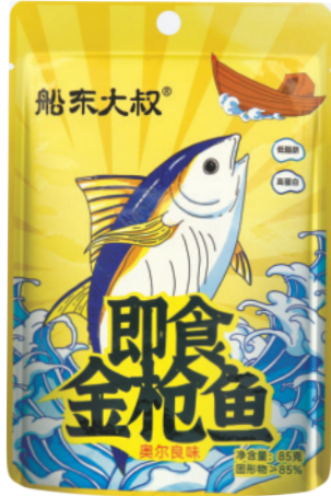
Ready-to-eat tuna, Orleans Flavor

Internal capacity: 85g Inside specification: 85gX60