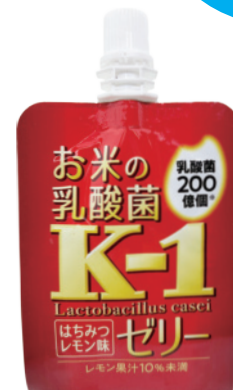
Honey Lemon Flavor

It's produced from rice K-1 Lactic acid bacteria 20 billion additions per bag Drink and be energetic