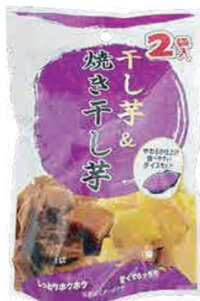
Mixed sweet potato

Internal capacity: 70g Inside specification: 70gX12X4