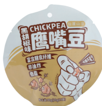
Black pepper flavored chickpeas

Internal capacity: 80g Inside specification: 20gX4X40