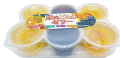
Six Couplets Pulp Jelly (Grape + Orange + Mixed)