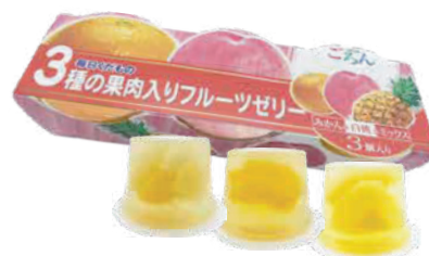
Triple Pulp Jelly (Peach + Orange + Assorted)