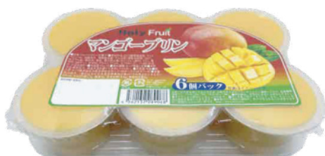
Mango pudding in six pairs